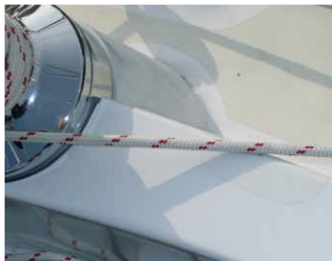
After: the coaming is protected by PSP Anti Chafe patch